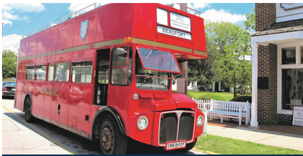
Ride the Double-Decker Bus