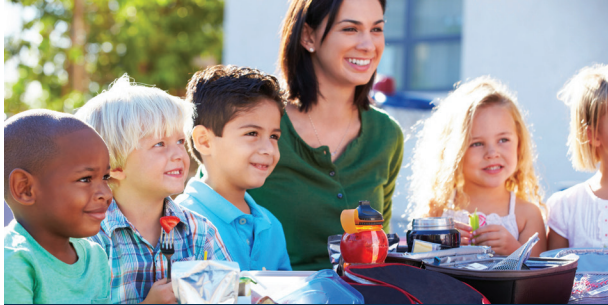
Picnic on our grounds