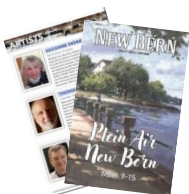
Don't miss the May edition

We invited 35 nationally acclaimed plein air artists to come paint our community allowing our citizens to watch & become part of the creative process. In return we provide hosting, sales venues, & create events to increase appreciation and ownership of the visual arts.