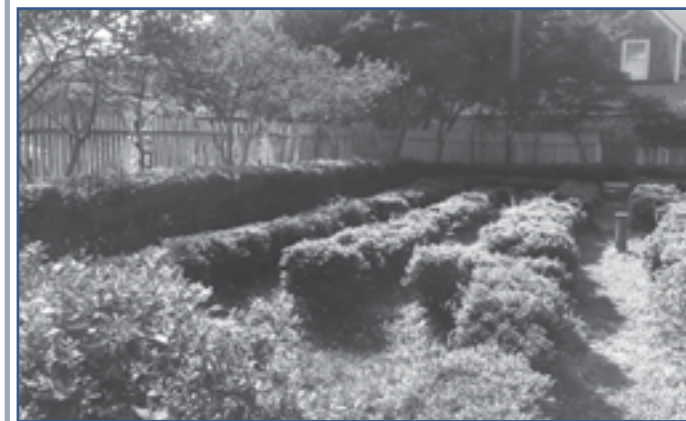
Thank you to Styron's Tree Service for clearing the garden!

Brochures and large signage will be designed explaining the plants, pollinators and their effect on our environment and food production. These materials will promote the garden and the grounds while teaching the importance of maintaining a healthy environment. This garden can provide school groups with a learning experience that can begin in the garden and hopefully stay with them the rest of their lives. Gradually, we are hoping to make the grounds behind the Manson House reflect the excellence of the award winning restoration inside the house. ■