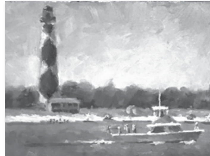
Cape Scape by Fen Rascoe

Beaufort Historic Site 130 Turner Street 252.728.5225 | 800.575.7483 Monday - Saturday 10am - 4pm