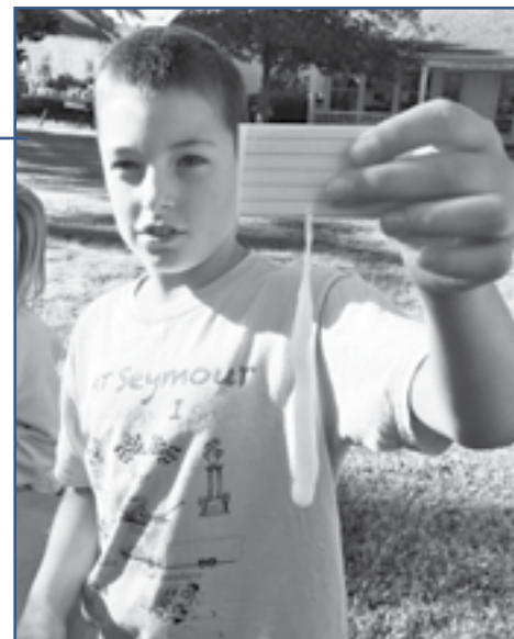
Showing off a candle in the beginning stages.

County through events such as Harvest Time and Kindergarten Thanksgiving, run heavily through the efforts of dedicated volunteers. Volunteers can participate in a day of training to prepare for the Harvest Time events and time with children on October 3rd. Harvest Time is designed to