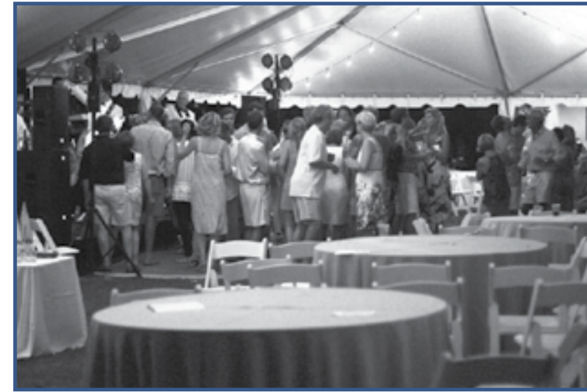
The dance floor was packed all night thanks to the band Punch! The tables remained vacant as guests crowded together to dance the night away!

The Summer Party was a great event! Beautiful weather brought a night of dancing, drinking and donations! Music from the band "Punch" was a huge hit, keeping the dance floor crowded throughout the night. The high energy continued with a new online bidding system. This year launched the beginning of paperless bidding at the Summer Party. Through the online service, auction items were live weeks prior to the event and were accessible leading up to and during the event worldwide.