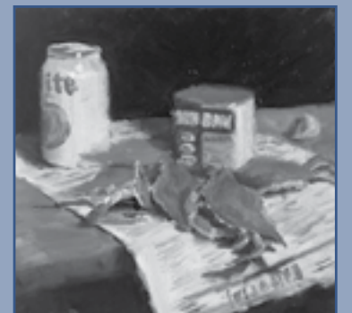
Tastes Great Less Filling by Fen Rascoe

Artist Fen Rascoe will host a two day workshop, October 12th and 13th from 10 am to 4 pm at St. Paul's Episcopal Church Parish Hall. Students can look forward to learning from Fen's unique style through a small class environment. The workshop fee is $250 per student and due to very limited class size, reservations are required and may be made by calling the Beaufort Historic Site at 252-728-5225.